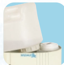
Removable, 3-litre tank