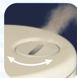
Adjustable and 360° swivel atomisation diffuser