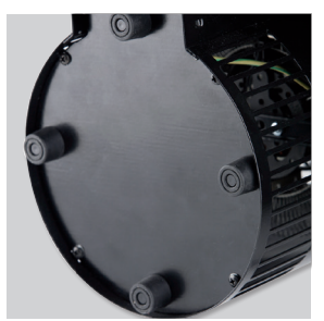
Rubber supports allowing to insert the FIRE FAN on the floor of a chimney.