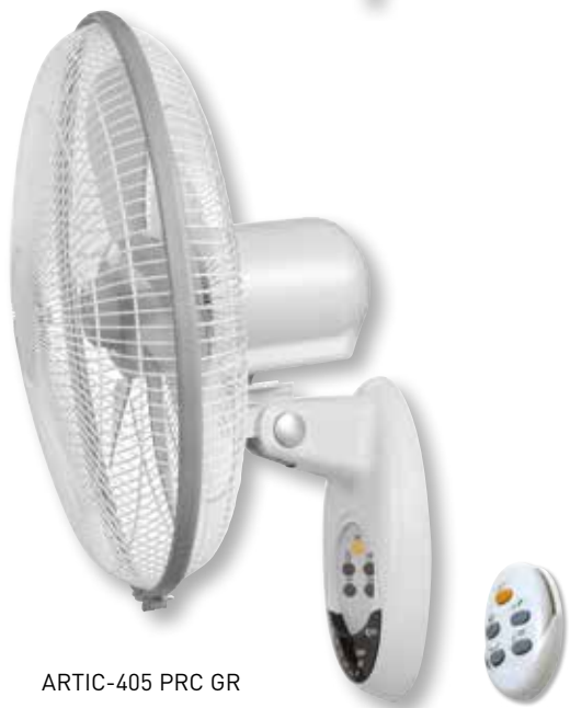
ARTIC-405 PRC GR

Wall fans with 3 speed controller, timer and detachable proof guard.