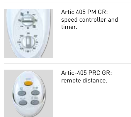
Artic 405 PM GR: speed controller and timer.