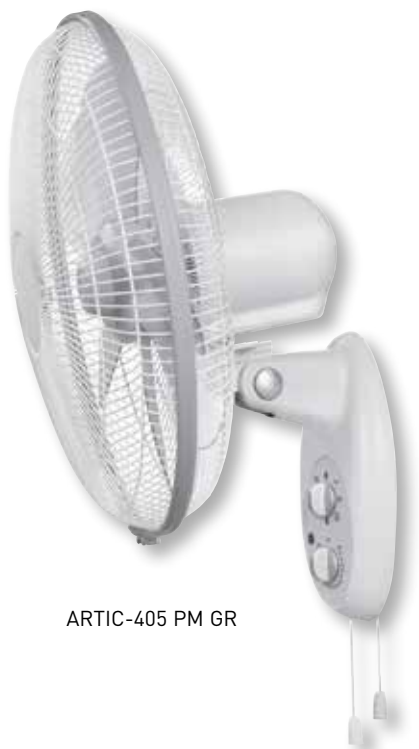
ARTIC-405 PM GR