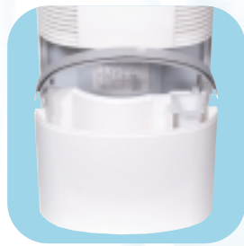
Removable 4-litre water tank